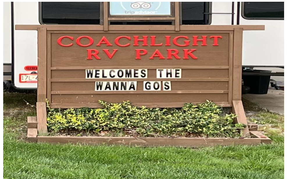
Coachlight RV Park, Carthage, Missouri

Our May Rally started with a Meet and Greet on Sunday, May 11th. The Hosts welcomed all to Happy Hour and then a delicious BBQ dinner from Boomers BBQ in Carthage. Two couples had the dreaded “Check Engine” lights on the way and did not make it. They were greatly missed and all others arrived safely ready for a good time.