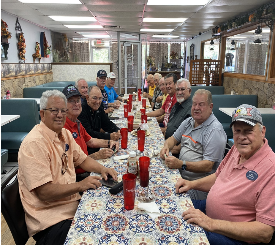
The Men's Luncheon was at Bob's Family Restaurant.

For dinner everyone was on their own after Happy Hour.