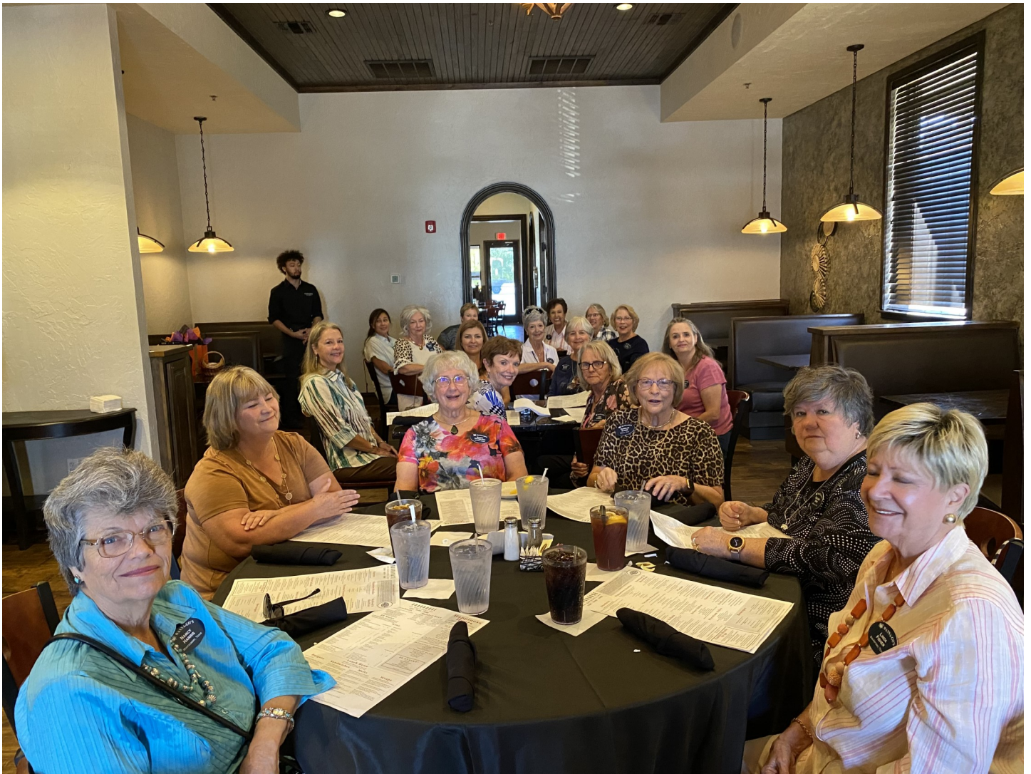
Wednesday afternoon was the Women's Luncheon at The Roadhouse Bar & Grill.